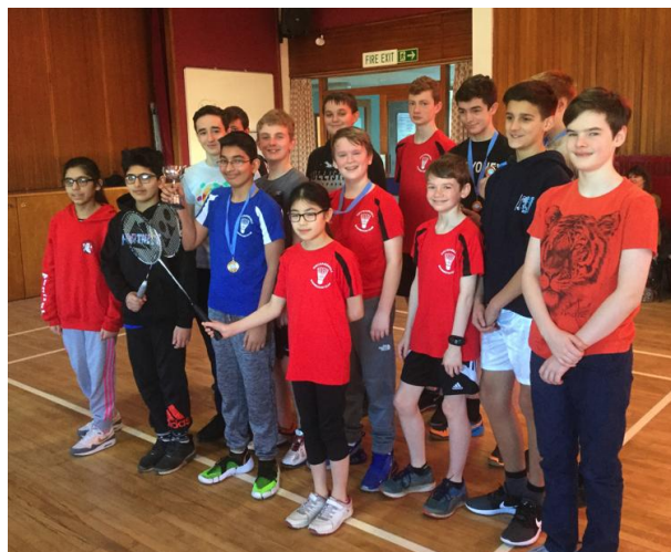
Junior Badminton Members