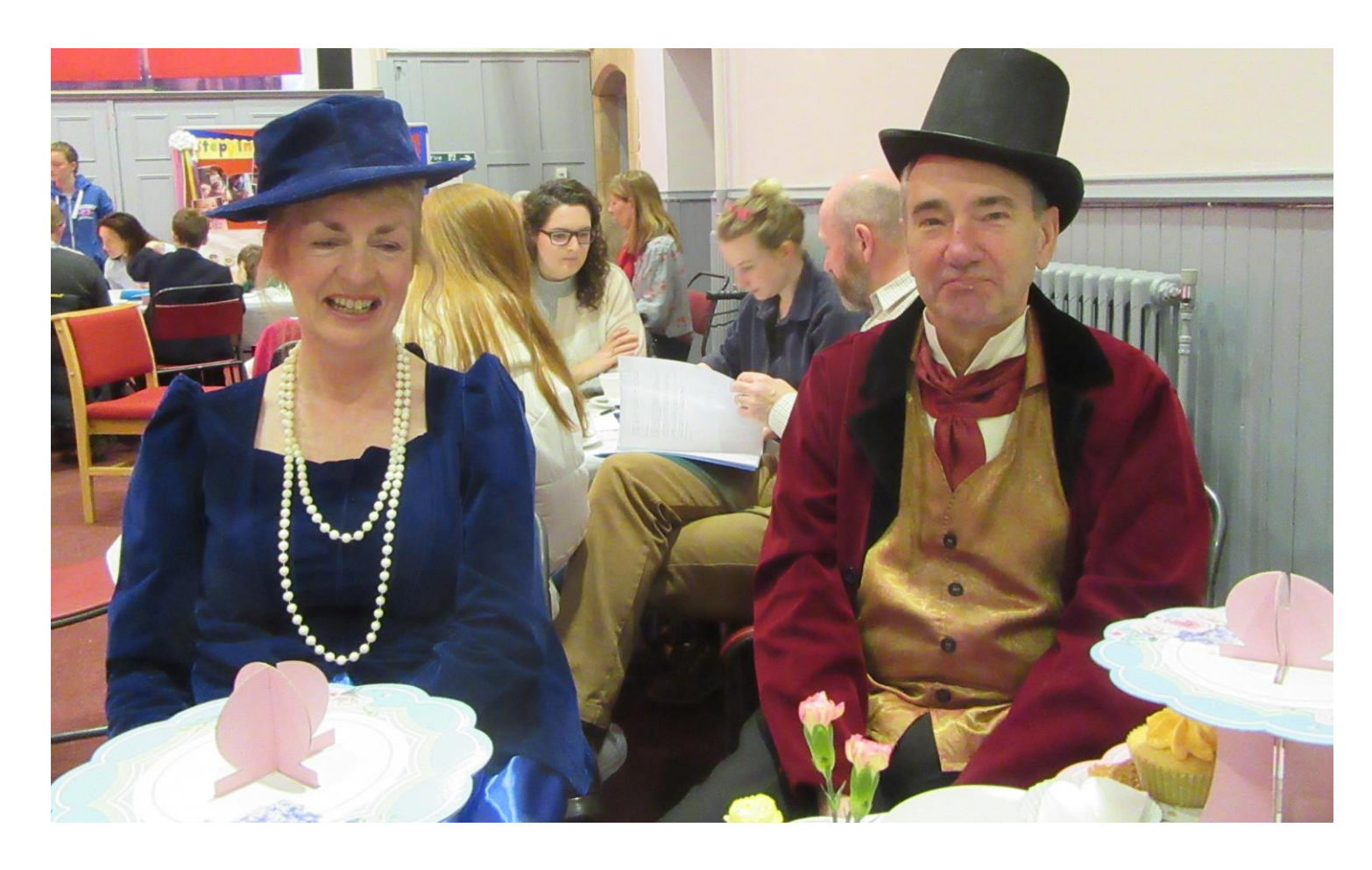
Where is Jane Marple or Hercule Poirot?