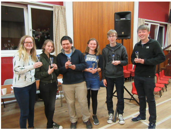
The Better Half of Fusion