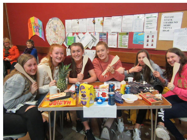
Let's Get Quizzical