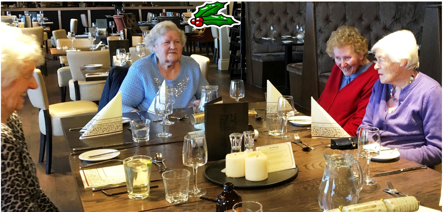
The Guild enjoying their Christmas lunch at the Fenwick Hotel