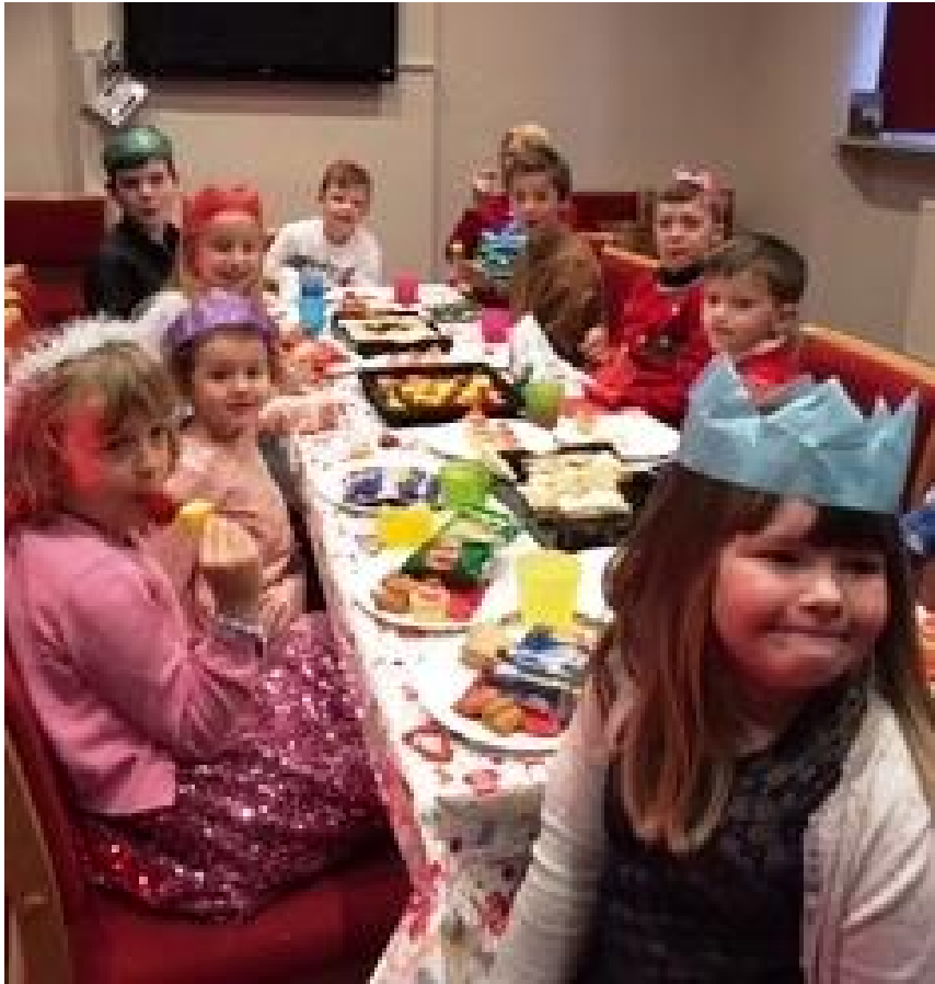
Stepping Stones enjoying their Christmas Party on 11 December